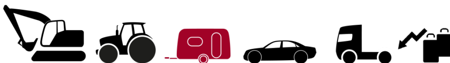
figure 2: the market segments of PARAT Group

As the world's largest LFI manufacturer with its core competencies in the ,agricultural machinery and construction vehicles' sector, we also offer exclusive engineering and development support.