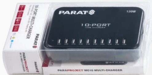
PARAPROJECT® MC10 Multi Charger Art.-No. 990.555.999